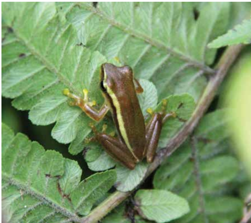
Figure 10 Striped Pygmy Tree Frog, Chiromantis vittatus (Boulenger, 1887) from Peling Tsho, Pema Gatshel.

Pit Viper ( Trimeresurus popeiorum ), which are supposed to be of significant conservation value. A technical report on this survey is pending. While some species are new to Bhutan, most of the species are supposed to have been already known to occur on the Indian side of the survey area.