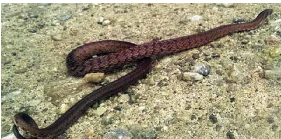
FIGURE 5 Russel's Kukri, Oligodon taeniolatus (Jerdon, 1853) from Trashigang.