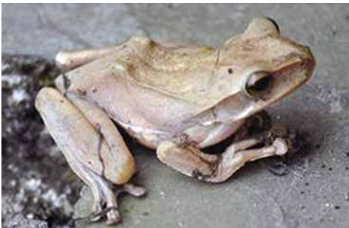
FIGURE 1 Chunar Tree Frog ( Polypedates maculatus ) from Zhemgang.