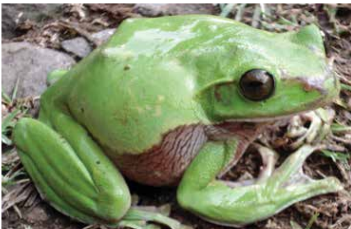
FIGURE 2 Large Tree Frog ( Rhacophorus maximus ) from Zhemgang.