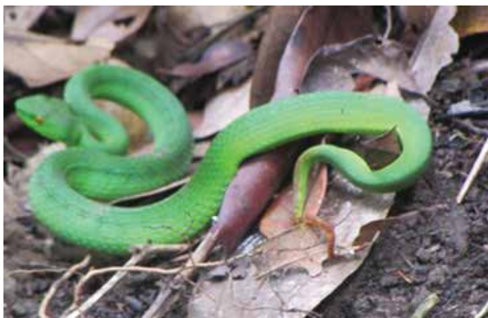
FIGURE 6 Yunnan Bamboo Pit Viper, Trimeresurus cf. stejnegeri yunnanensis (Schmidt, 1925) from Zhemgang.