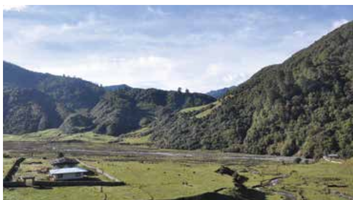
FIGURE 4 Sakteng valley, habitat for Annandali's Paa and Blandford's Paa.