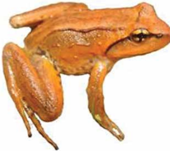
Nanorana sp. from Rigsoom Gonpa, Trashiyangtse