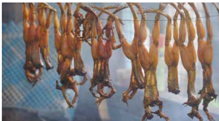
FIGURE 3 Mass frog drying up for consumption at Jomotshangkha.

There are also confirmed cases of consumption of Annandali's Paa ( Nanorana annandalii ) and Blandford's Paa ( Nanorana blandfordii ) by the residents of Sakteng, Trashigang District. Perhaps a study should be conducted to assess the status of these species so that protection status can be given by the state if the research finds imminent threat to the species. At present, there are good numbers of both the species in the stream near Sakteng village (Fig. 4).