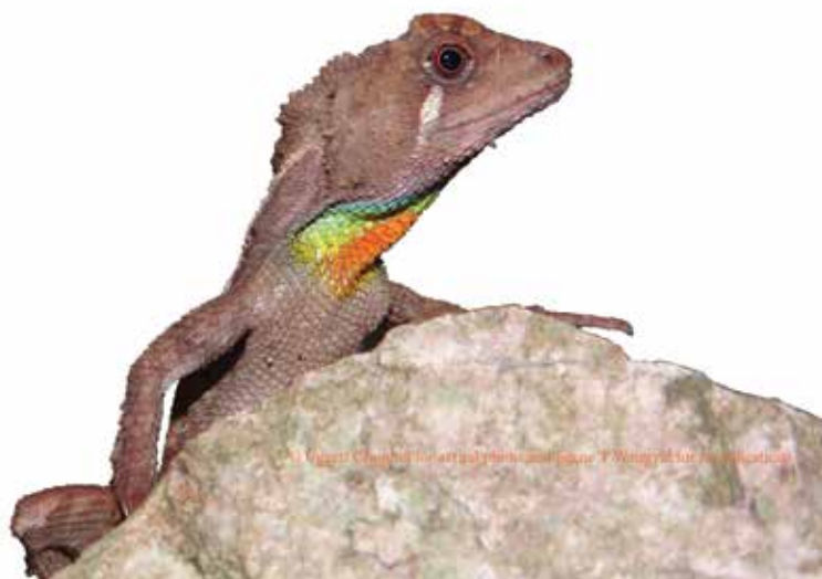
Figure 8 Blue Fan-throated Lizard, Ptyctolaemus gularis (Peters, 1864) from Samdrup Jongkhar.