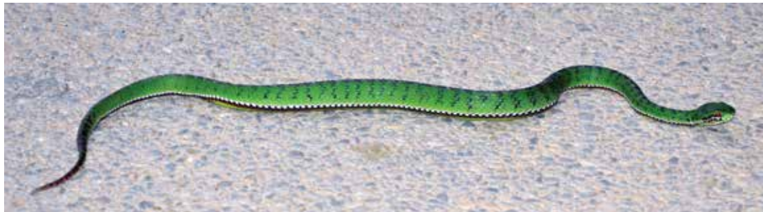
FIGURE 7 Tibetan Bamboo Pit Viper, Trimeresurus cf. tibetanus (Huang, 1982) from Trongsa (Photo Credit: Jigme Tshering, Trongsa).