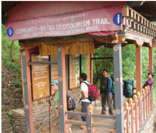
Entrance to the Nabji Community-Based Ecotourism Trail

UGYEN NAMGYEL 1* , JILL M. BELSKY 2 AND STEPHEN F. SIEBERT 3